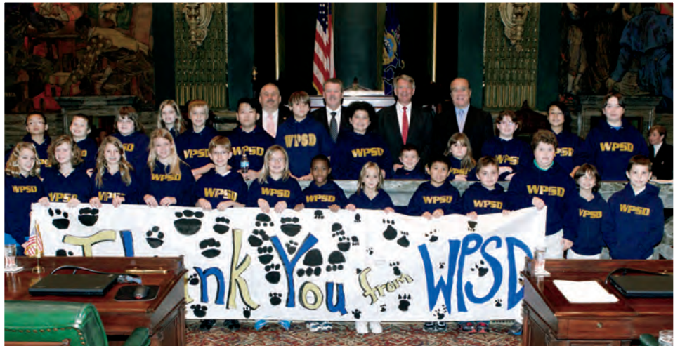
Senator Brewster visits with students from the Western Pennsylvania School for the Deaf.