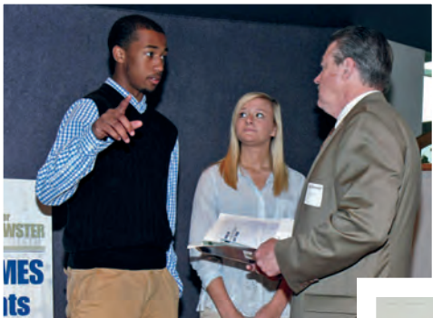
Sen. Brewster attends a check presentation at Serra Catholic High School. United States Steel Corp. gave $60,000 in Educational Improvement Tax Credit scholarships to the Bridge Educational Foundation for Serra Catholic and 11 other Allegheny County schools.