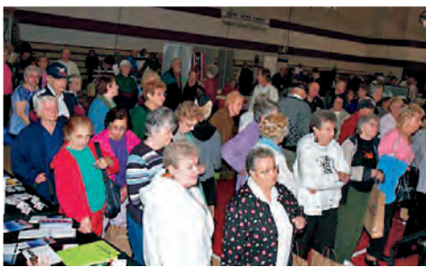
ABOVE: Senator Brewster's Senior Wellness and Safety Expo.