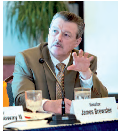
Senator Brewster addresses the public at the Senate Game and Fisheries Committee hearing.

The reform package would be funded by a new fee paid by shale drillers. All funds from the new fee would be earmarked for education.