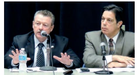
Sen. Brewster hosts a Senate Transportation Committee hearing at CCAC Boyce Campus - Monroeville. Joining him is Sen. Jay Costa (D-Pittsburgh).

Senator Brewster's legislation amends Title 53 (Municipalities Generally) and Title 75 (Vehicles) respectively. The addition to Title 53 will add a section to read: Municipal Police Recruitment and Retention Program. The commission shall administer this Fund, relating to a law enforcement surcharge, and make grants from the fund for recruitment and retention of a municipality's part-time police force in accordance with this section. The addition to Title 75 will add a section to read: Law Enforcement Enhancement Surcharge. A surcharge of $10 will be levied or imposed as provided by law, exclusive of parking offenses, upon conviction for any violation of the provisions of this title or other statute of the Commonwealth. The purpose of the grants shall be used for the purpose of hiring and retaining part-time police officers in a municipality and shall be used to pay a portion of the salary of a part-time police officer. Grants shall not exceed $5,000 per police officer position and shall be used to supplement the part-time police salary paid by the municipality up to a maximum of $15 per hour of pay not to exceed 85 percent of a full-time base salary for a police officer in the municipality. Rate shall be calculated based on average salaries for 2011, as adjusted annually by the Consumer Price Index for the metropolitan area in which the municipality is located.