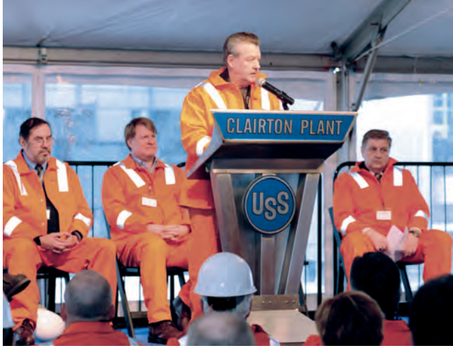
Sen. Brewster joined U.S. Steel Officials and government leaders in the commissioning of Clairton Coke Work's C Battery.